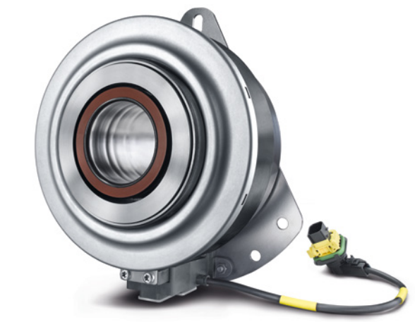
Concentric pneumatic clutch actuator CPCA

After installing a concentric pneumatic clutch actuator, it must be recalibrated using a suitable diagnostic device (e.g. Jaltest by COJALI). Without calibration, the clutch will grab when starting off and the vehicle will be difficult to manoeuvre under load. In addition, various error messages will be displayed on the vehicle information display.