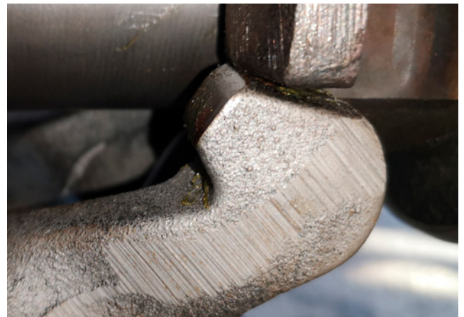
Figure 1: Release fork with flat cam profile

See parts catalogue for current assignment