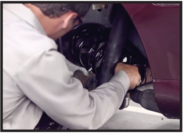
FIGURE 20-1 2. USING A FLOOR JACK, RAISE THE REAR AXLE. (FIGURE 20-2)

INSTALL THE COIL SPRINGS ONTO THE REAR AXLE. (FIGURE 20-1)